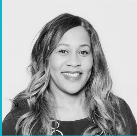
Karen Blackett OBE